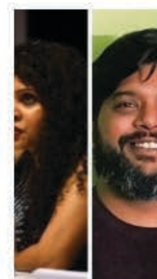
7 Journalists Who Spoke Truth To Power And Brought Change In 2021