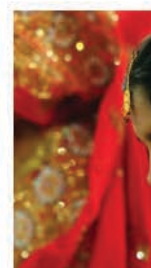
Raising Age Of Marriage For Women From 18 To 21? Not A Good Idea At All