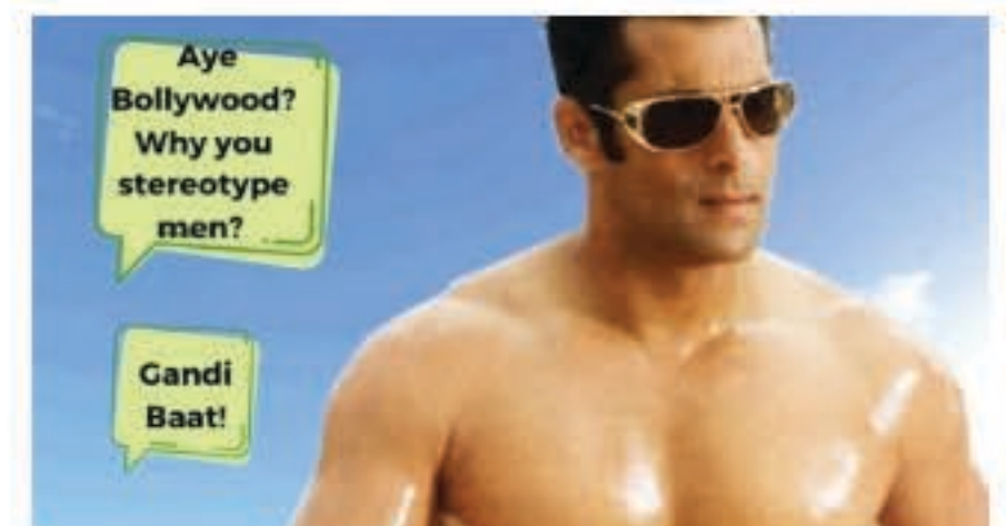
5 Polls To Check How 'Being A Man' Has Impacted You