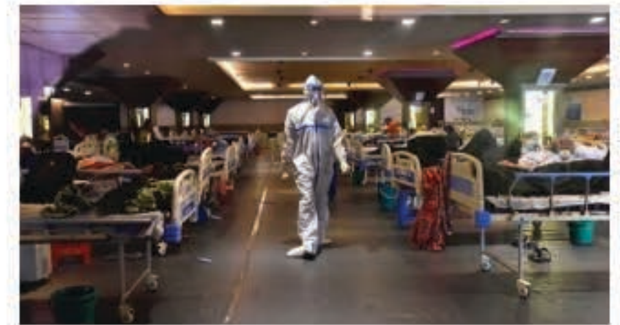
COVID-19: Crowdsourced List Of Donation Drives Across India

Like what you read? Recommend or share it ahead.